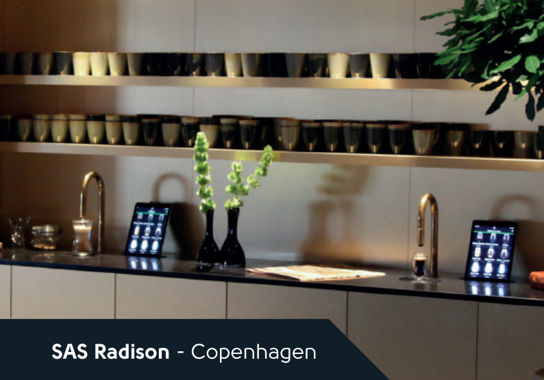
SAS Radison - Copenhagen