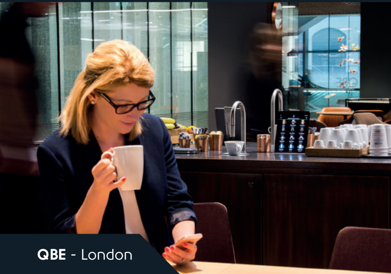
QBE - London