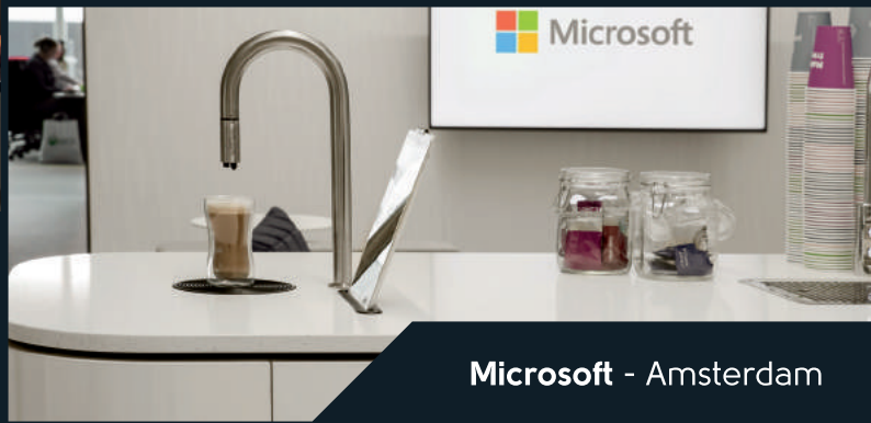
Microsoft - Amsterdam