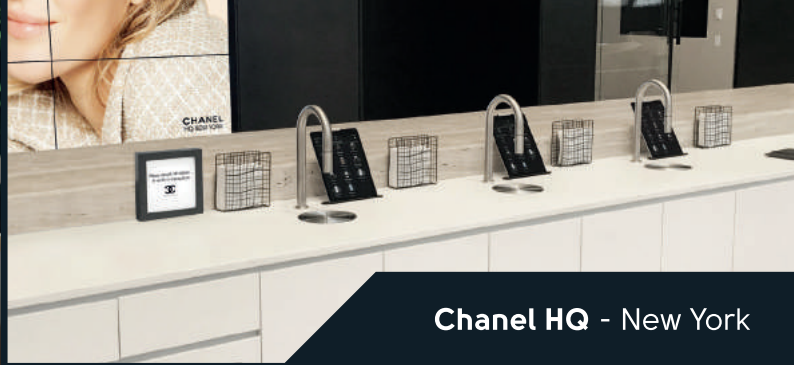
Chanel HQ - New York