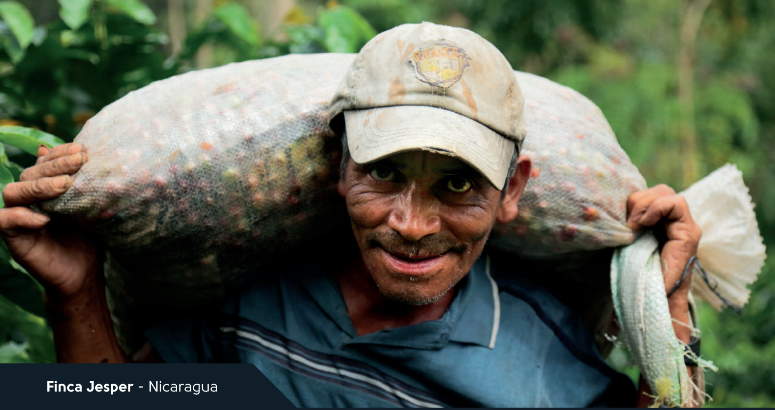
Finca Jesper - Nicaragua